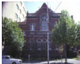
1 former primary school number 2365 queensberry street carlton front view feb1985