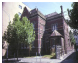
former primary school number 2365 queensberry street carlton front corner view feb1985