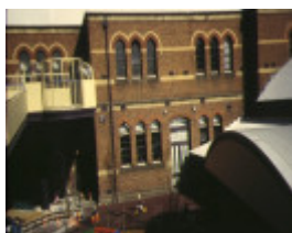
former primary school number 2365 queensberry street carlton rear view newly developed courtyard