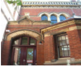
FORMER PRIMARY SCHOOL NO. 2365 SOHE 2008