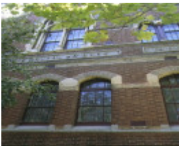
former primary school number 2365 queensberry street carlton detail of front windows