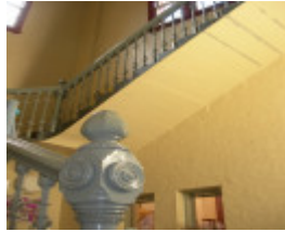
FORMER PRIMARY SCHOOL NO. 2365 SOHE 2008