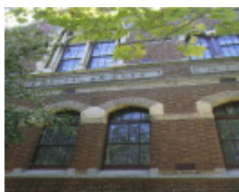
former primary school number 2365 queensberry street carlton detail of front windows