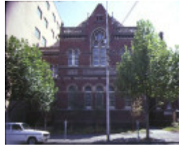
1 former primary school number 2365 queensberry street carlton front view feb1985