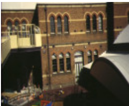
former primary school number 2365 queensberry street carlton rear view newly developed courtyard