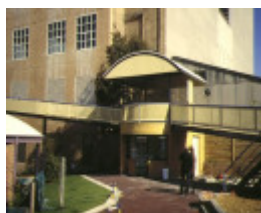
former primary school number 2365 queensberry street carlton new development