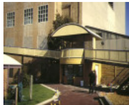
former primary school number 2365 queensberry street carlton new development