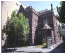
former primary school number 2365 queensberry street carlton front corner view feb1985