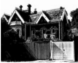
City of Kew Urban Conservation Study 1988