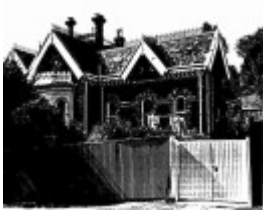
City of Kew Urban Conservation Study 1988