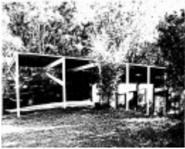
City of Kew Urban Conservation Study 1988