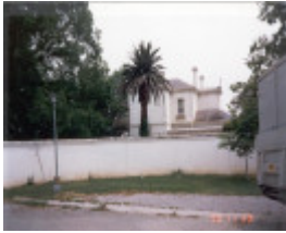
22364 Clarendon Eyre - 6 Robb Close, Bulleen (House)