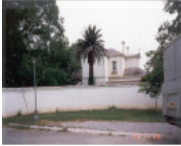
22364 Clarendon Eyre - 6 Robb Close, Bulleen (House)