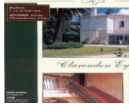
22364 Sales Brochure for Clarendon Eyre - 6 Robb Close, Bulleen