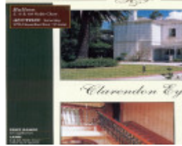
22364 Sales Brochure for Clarendon Eyre - 6 Robb Close, Bulleen