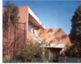
22365 House - 18 Summit Drive, Bulleen (B)