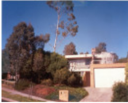
22365 House - 18 Summit Drive, Bulleen