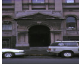
trades hall lygon street carlton detail of entrance