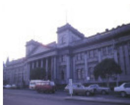
1 trades hall lygon street carlton front view jul1987