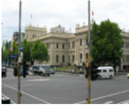
TRADES HALL SOHE 2008