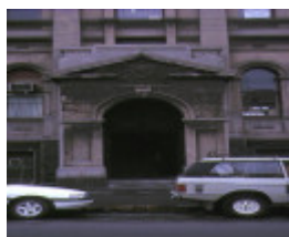
trades hall lygon street carlton detail of entrance