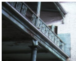
trades hall lygon street carlton balcony