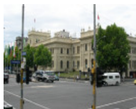
TRADES HALL SOHE 2008