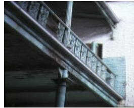
trades hall lygon street carlton balcony