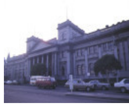
1 trades hall lygon street carlton front view jul1987