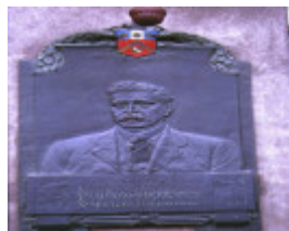
trades hall lygon street carlton cast iron frieze