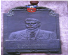
trades hall lygon street carlton cast iron frieze