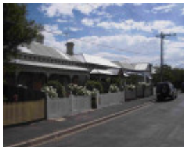
Dover Road and John Street Precinct, Hobsons Bay Heritage Study 2006