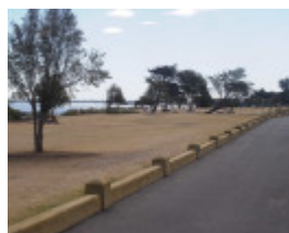
Esplanade Foreshore Heritage Precinct, Hobsons Bay Heritage Study 2006