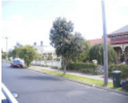
Hannan's Farm Heritage Precinct, Hobsons Bay Heritage Study 2006