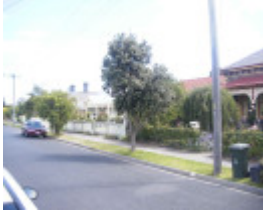
Hannan's Farm Heritage Precinct, Hobsons Bay Heritage Study 2006