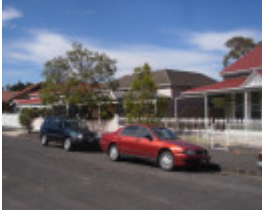
James Street Heritage Precinct WILLIAMSTOWN, Hobsons Bay Heritage Study 2006