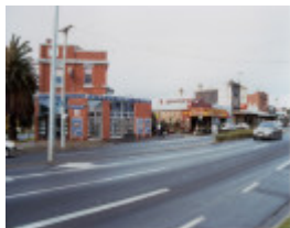
Melbourne Road Commercial Precinct NEWPORT, Hobsons Bay Heritage Study 2006