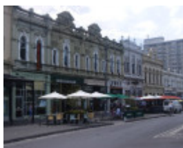
HNelson Place Heritage Precinct WILLIAMSTOWN, Hobsons Bay Heritage Study 2006