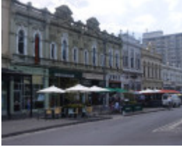
HNelson Place Heritage Precinct WILLIAMSTOWN, Hobsons Bay Heritage Study 2006