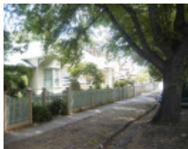
Pasco Street Heritage Precinct WILLIAMSTOWN, Hobsons Bay Heritage Study 2006