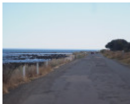
Point Gellibrand Heritage Precinct WILLIAMSTOWN, Hobsons Bay Heritage Study 2006