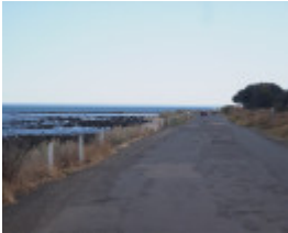
Point Gellibrand Heritage Precinct WILLIAMSTOWN, Hobsons Bay Heritage Study 2006