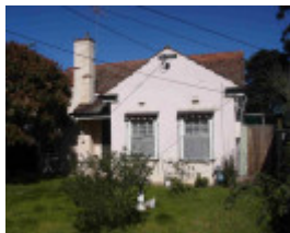
Solomit or Straw House Heritage Precinct ALTONA, Hobsons Bay Heritage Study 2006 - 169 Maidstone Street