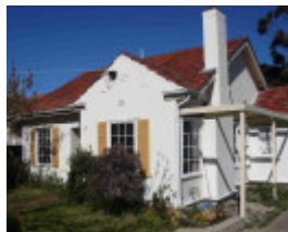
Solomit or Straw House Heritage Precinct ALTONA, Hobsons Bay Heritage Study 2006 - 171 Maidstone Street