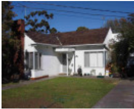
Solomit or Straw House Heritage Precinct ALTONA, Hobsons Bay Heritage Study 2006 - 175 Maidstone Street