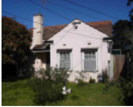
Solomit or Straw House Heritage Precinct ALTONA, Hobsons Bay Heritage Study 2006 - 169 Maidstone Street