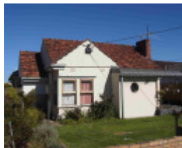
Solomit or Straw House Heritage Precinct ALTONA, Hobsons Bay Heritage Study 2006 - 173 Maidstone Street