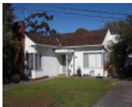
Solomit or Straw House Heritage Precinct ALTONA, Hobsons Bay Heritage Study 2006 - 175 Maidstone Street