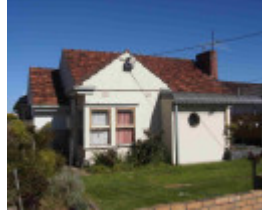
Solomit or Straw House Heritage Precinct ALTONA, Hobsons Bay Heritage Study 2006 - 173 Maidstone Street