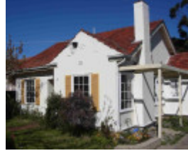
Solomit or Straw House Heritage Precinct ALTONA, Hobsons Bay Heritage Study 2006 - 171 Maidstone Street