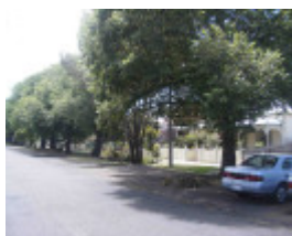
Verdon Street Heritage Precinct WILLIAMSTOWN, Hobsons Bay Heritage Study 2006