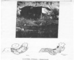
22494 Ross and Monica Larmer House - 42 Berrima Road, Donvale