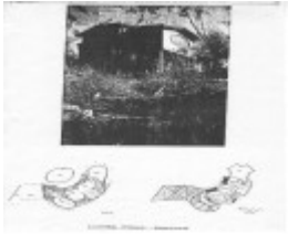
22494 Ross and Monica Larmer House - 42 Berrima Road, Donvale