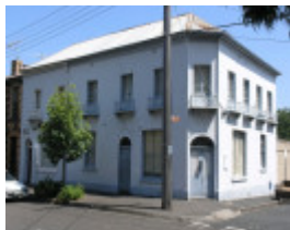
FORMER QUEENS ARMS HOTEL SOHE 2008