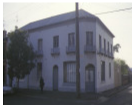
1 former queen anne hotel dorcass street south melbourne front view aug1998