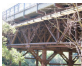
VICTORIA BRIDGE SOHE 2008