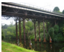
22610 Victoria street bridge richmond feb07 renee 2