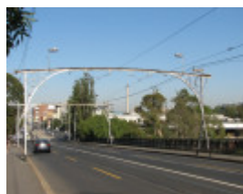
VICTORIA BRIDGE SOHE 2008