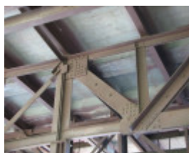
VICTORIA BRIDGE SOHE 2008