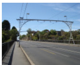
22610 Victoria street bridge richmond march07 ac gantries