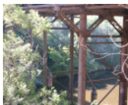
VICTORIA BRIDGE SOHE 2008