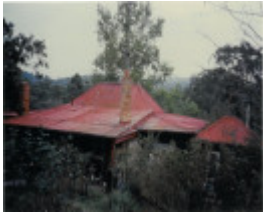
22625 Nilja - Alexander Road, Warrandyte