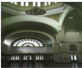
royal exhibition buildings nicholson street carlton dome interior