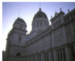
royal exhibition buildings nicholson street carlton side elevation