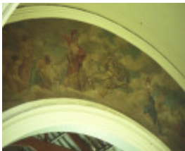
royal exhibition buildings nicholson street carlton detail of wall painting