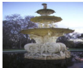
royal exhibition buildings nicholson street carlton fountain front view