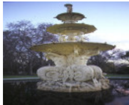
royal exhibition buildings nicholson street carlton fountain front view