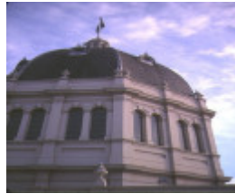
royal exhibition buildings nicholson street carlton dome detail