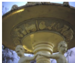
royal exhibition buildings nicholson street carlton fountain detail