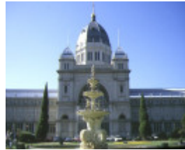
royal exhibition buildings nicholson street carlton front view aug1985