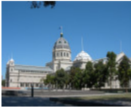
ROYAL EXHIBITION BUILDING AND CARLTON GARDENS (WORLD HERITAGE PLACE) SOHE 2008