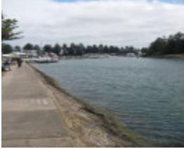
PROV H2213 Moyne River Training Walls 4