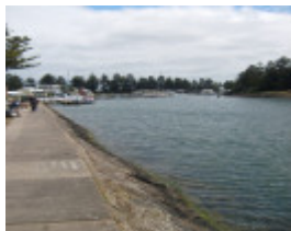
PROV H2213 Moyne River Training Walls 4