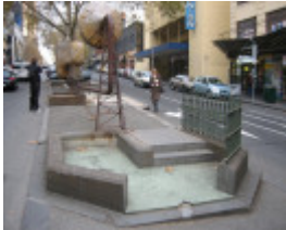
H2108 Underground Toilets Melbourne 08 06 06 mz 039