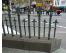
H2108 Underground Toilets Melbourne 08 06 06 mz 048