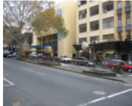
H2108 Underground Toilets Melbourne 08 06 06 mz 050