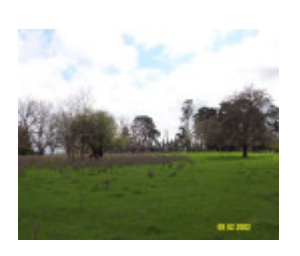
23071 Monivae original site Hamilton Port fairy Rd 1472