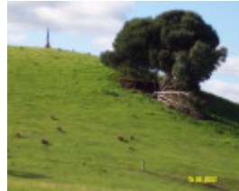
23073 Mount Koroite Cemetery Coleraine 1278