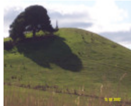
23073 Mount Koroite Cemetery Coleraine 1279