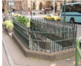
H2109 Underground Toilet Queen Street 08 06 06 mz 016