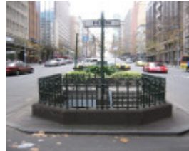
H2109 Underground Toilet Queen St 08 06 06 mz 018