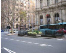
H2109 Underground Toilet Queen St 08 06 06 mz 015