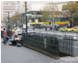
Underground women's toilet Elizabeth St GPO 08 06 06 mz 025