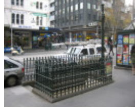
Underground men's toilet Elizabeth St GPO 08 06 06 mz 028