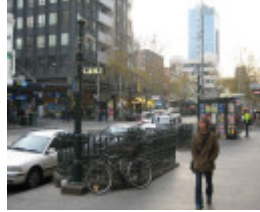
Underground men's toilet Elizabeth St GPO 08 06 06 mz 026