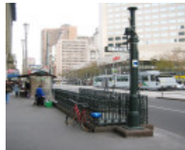
23086 Underground women's toilet Elizabeth St GPO 08 06 06 mz 023