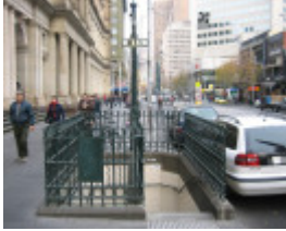
Underground men's toilet Elizabeth St GPO 08 06 06 mz 036