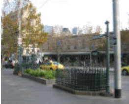
H2111 Underground Toilets Elizabeth & Victoria Sts 08 06 06 mz 004