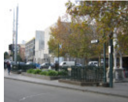
H2111 Underground Toilets Elizabeth & Victoria Sts 08 06 06 mz 014