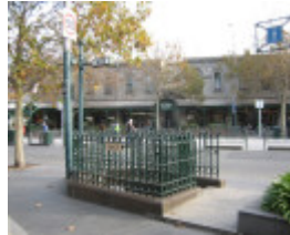
H2111 Underground Toilets Elizabeth & Victoria Sts 08 06 06 mz 001