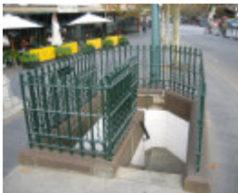
H2111 Underground Toilets Elizabeth & Queen Sts 08 06 06 mz 011