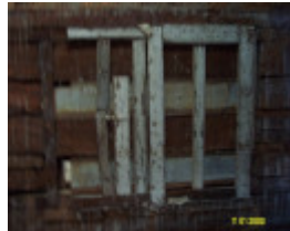
H0361 Kongbool Balmoral 1st blind window 2353