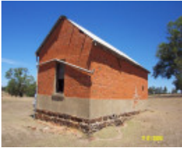
H0361 Kongbool Balmoral brick store 2371