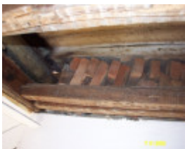
H0361 Kongbool Balmoral 1st former chimney 2363