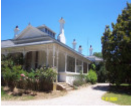
H0361 Kongbool Balmoral side elevation 2343