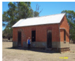
H0361 Kongbool Balmoral brick store 2367