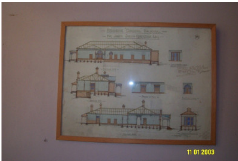
H0361 Kongbool Balmoral architect s dwgs 2375