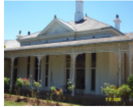
H0361 Kongbool Balmoral side elevation 2339