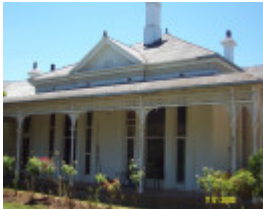
H0361 Kongbool Balmoral side elevation 2339