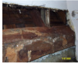
H0361 Kongbool Balmoral 1st valley gutter 2357