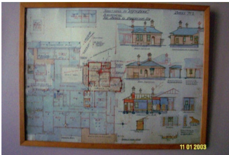
H0361 Kongbool Balmoral architect s dwgs 2372