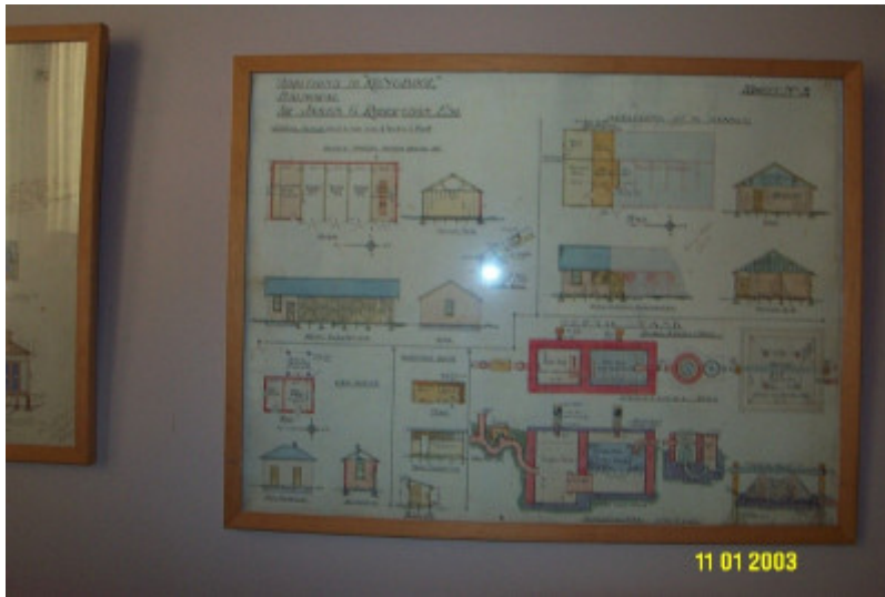
H0361 Kongbool Balmoral architect s dwgs 2374