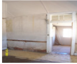
H0361 Kongbool Balmoral 1st rear room 2358