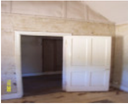
H0361 Kongbool Balmoral 1st imported door 2361