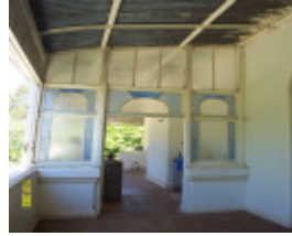
H0361 Kongbool conservatory 2378