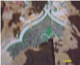
H0361 Kongbool Balmoral 1st wallpaper 2352