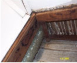
H0361 Kongbool Balmoral 1st valley gutter 2356