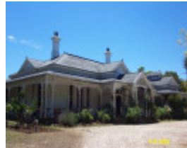
H0361 Kongbool Balmoral facade 2338