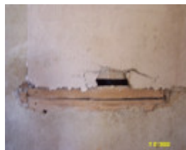
H0361 Kongbool Balmoral 1st hand split lathes 2360