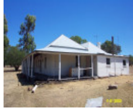
H0361 Kongbool Balmoral 1st side 2366