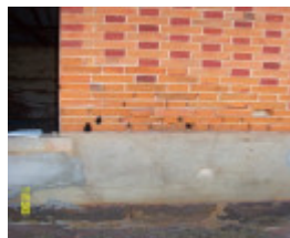
H0361 Kongbool Balmoral brick store 2370