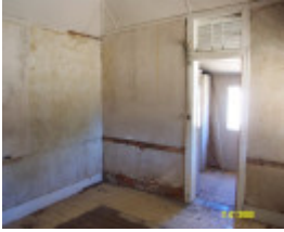
H0361 Kongbool Balmoral 1st rear room 2359