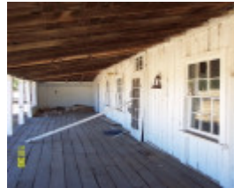
H0361 Kongbool Balmoral 1st verandah 2349