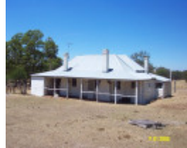
H0361 Kongbool Balmoral 1st facade 2345