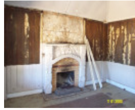
H0361 Kongbool Balmoral 1st main room 2350