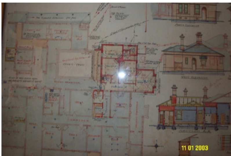
H0361 Kongbool Balmoral architect s dwgs 2376