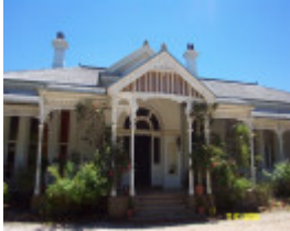
H0361 Kongbool Balmoral entrance 2341