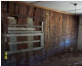
H0361 Kongbool Balmoral 1st blind window 2354