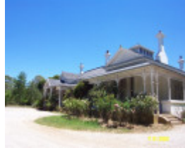
H0361 Kongbool Balmoral facade 2344