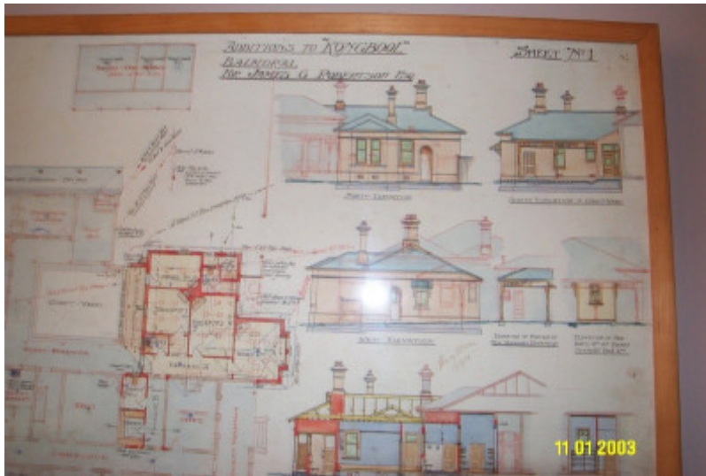
H0361 Kongbool Balmoral architect s dwgs 2377