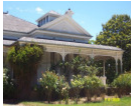
H0361 Kongbool Balmoral billiard room 2342