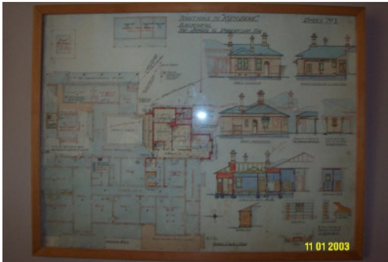
H0361 Kongbool Balmoral architect s dwgs 2373