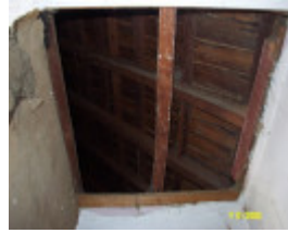
H0361 Kongbool Balmoral 1st shingles 2362