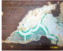
H0361 Kongbool Balmoral 1st wallpaper 2351