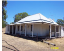
H0361 Kongbool Balmoral 1st facade 2347