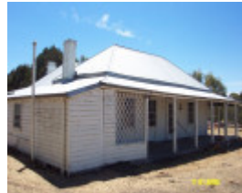
H0361 Kongbool Balmoral 1st facade 2346