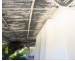
H0361 Kongbool verandah roof 2379