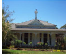
H0361 Kongbool Balmoral side elevation 2340