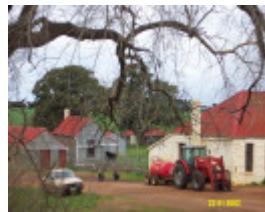
23192 Bassett Homestead Branxholme milking shed 1399