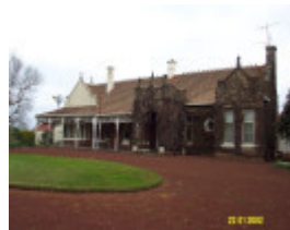
23192 Bassett Homestead Branxholme front elevation 1407