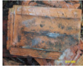
23192 Bassett Homestead Branxholme roof tile 1410