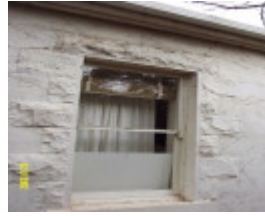
23192 Bassett Homestead Branxholme side elevation 1415