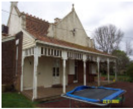
23192 Bassett Homestead Branxholme side elevation 1403