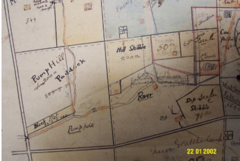
23192 Bassett Homestead Branxholme estate map 1379