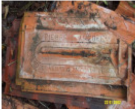
23192 Bassett Homestead Branxholme roof tile 1409