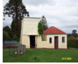
23192 Bassett Homestead Branxholme shed and tank stand 1397