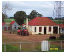
23192 Bassett Homestead Branxholme stables and coachhouse 1398