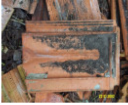
23192 Bassett Homestead Branxholme roof tile 1412