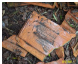
23192 Bassett Homestead Branxholme roof tile 1408