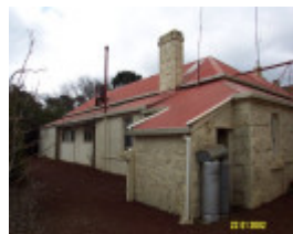
23192 Bassett Homestead Branxholme rear elevation 1418