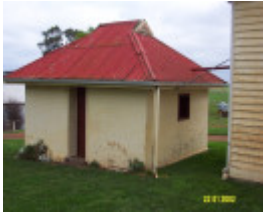
23192 Bassett Homestead Branxholme dairy 1395