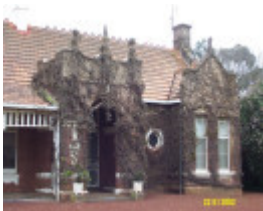
23192 Bassett Homestead Branxholme front elevation 1406