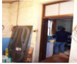
23192 Bassett Homestead Branxholme office 1382