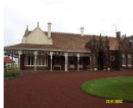
23192 Bassett Homestead Branxholme front elevation 1405