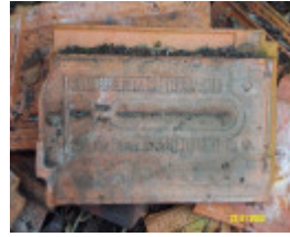
23192 Bassett Homestead Branxholme roof tile 1411