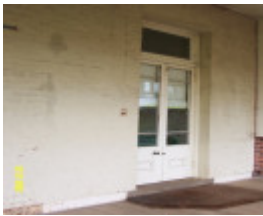
23192 Bassett Homestead Branxholme side elevation 1404