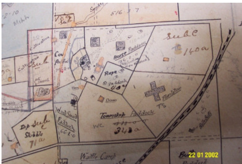
23192 Bassett Homestead Branxholme estate plan 1378