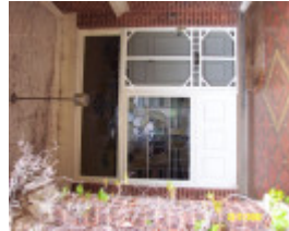
23192 Bassett Homestead Branxholme front door 1422