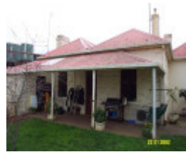
23192 Bassett Homestead Branxholme side elevation 1420