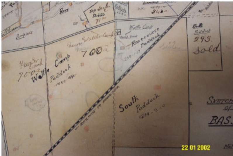
23192 Bassett Homestead Branxholme estate map 1380