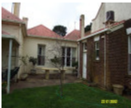
23192 Bassett Homestead Branxholme side elevation 1421