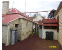
23192 Bassett Homestead Branxholme side elevation 1419