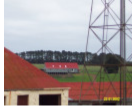
23192 Bassett Homestead Branxholme shearing shed 1400