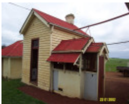
23192 Bassett Homestead Branxholme meat house 1394