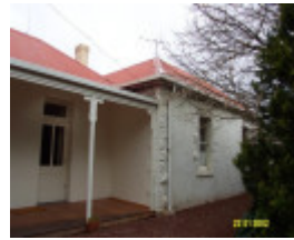
23192 Bassett Homestead Branxholme side elevation 1414