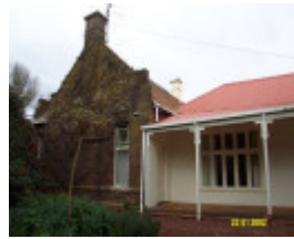
23192 Bassett Homestead Branxholme side elevation 1413