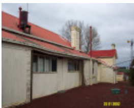
23192 Bassett Homestead Branxholme rear elevation 1417