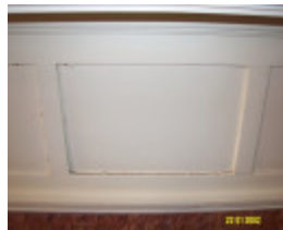
23192 Bassett Homestead Branxholme front hall mantel 1387