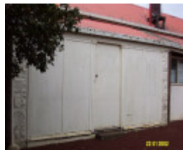
23192 Bassett Homestead Branxholme rear elevation 1416