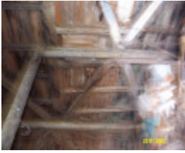
23192 Bassett Homestead Branxholme tank stand 1402