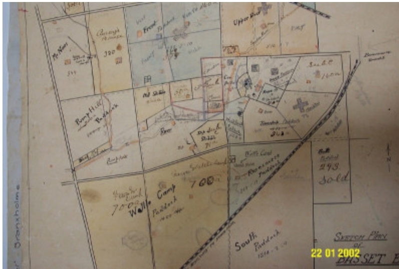
23192 Bassett Homestead Branxholme estate plan 1377