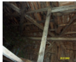
23192 Bassett Homestead Branxholme tank stand 1401