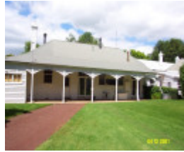
23195 Nareen homestead rear garden 0283