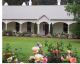
23195 Nareen Homestead Complex facade 1926