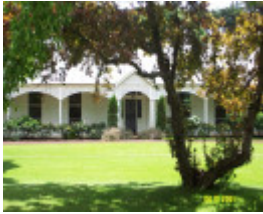
23195 Nareen garden facade 0285