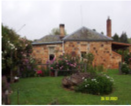
23206 Konong Konongwootong side elevation 2018