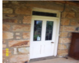
23206 Konong Konongwootong front door 2016