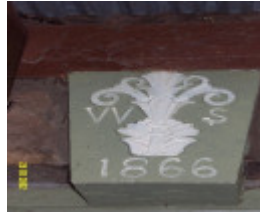
23206 Konong Konongwootong dated keystone 2014