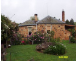
23206 Konong Konongwootong side elevation 2018