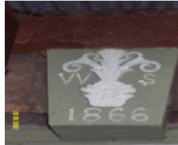
23206 Konong Konongwootong dated keystone 2014