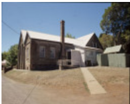
Christ Church School_Daylesford_South Elevation_Feb 2004_mz