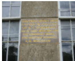
Christ Church School_Daylesford_Plaque_Fe 2004_mz