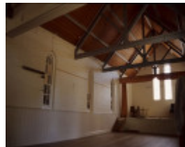
Christ Church School_Daylesford_Interior Original Wing_Feb 2004_mz