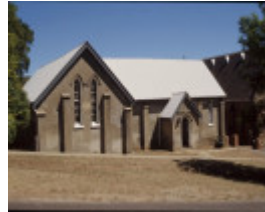
Christ Church School_Daylesford_North Elevation 02_Feb 2004_mz