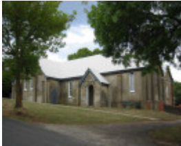
Christ Church School_Daylesford_North Elevation 01_Feb 2004_mz