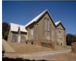
Christ Church School_Daylesford_West Elevation_Feb 2004_mz