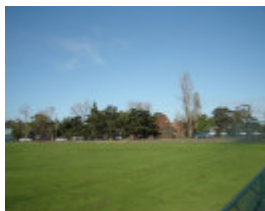
poplar park pavilion view from oval jun07 jmb