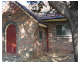
royal park pavilion front entrance detail apr07 jmb