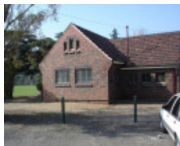
poplar oval toilets apr07 jmb