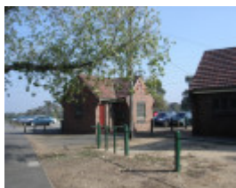
royal park toilet block apr07 jmb