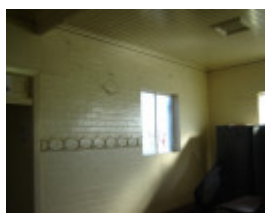
poplar oval pavilion interior with coat hooks jun07 jmb