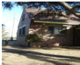
poplar oval pavilion front elevation jun07 jmb