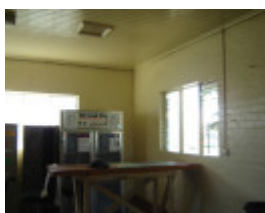
poplar oval pavilion interior jun07 jmb