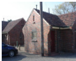
royal park toilet block pavilion apr07 jmb