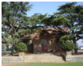
royal park pavilion steps entrance apr07 jmb