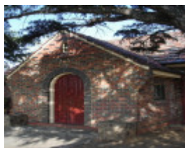
royal park pavilion front entrance apr07 jmb