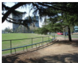
poplar oval pavilion spectator seats apr07 jmb