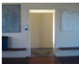
poplar oval pavilion interior exit jun07 jmb