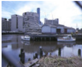
CARGO SHEDS 4, 5, 6, 7, 8, 9 SOHE 2008 1 cargo sheds 4 5 6 7 8 9 south wharf road south melbourne cargo shed 4