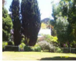
23400 Riverside Garden 0178