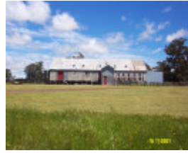
23400 Riverside Woolshed 0176