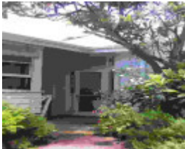
23400 Riverside garden entrance 0180