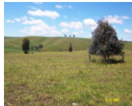
23400 Riverside original site 0173