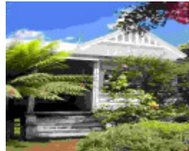
23400 Riverside garden entrance 0183