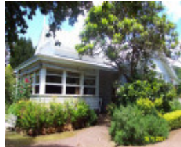
23400 Riverside garden entrance 0181