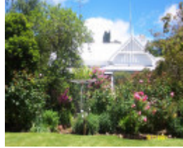
23400 Riverside Garden 0179