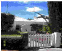
23400 Riverside side entrance 0186