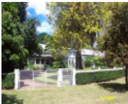
23400 Riverside main entrance 0184