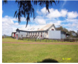
23400 Riverside woolshed 0177