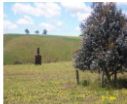
23400 Riverside original site 0174