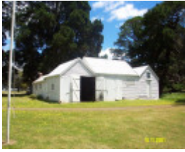
23400 Riverside stables 0185