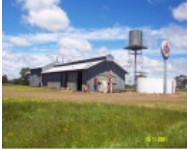
23400 Riverside Barn 0175