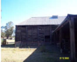
23434 Glendinning Homestead Balmoral woolshed 2146