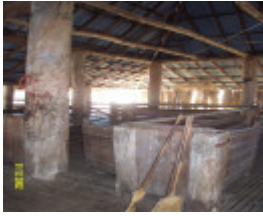
23434 Glendinning Homestead Balmoral woolshed 2141