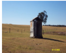
23434 Glendinning Homestead Balmoral woolshed dunny 2145