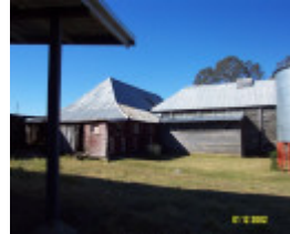
23434 Glendinning Homestead Balmoral woolshed 2148