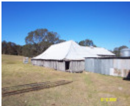
23434 Glendinning Homestead Balmoral woolshed 2149