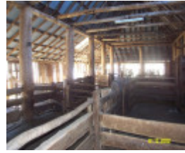
23434 Glendinning Homestead Balmoral woolshed 2143