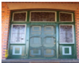
23434 Glendinning Homestead Balmoral front door 2134