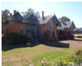
23434 Glendinning Homestead Balmoral facade 2132