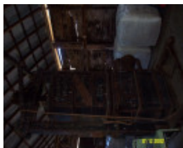
23434 Glendinning Homestead Balmoral woolpress 2137