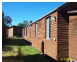
23434 Glendinning Homestead Balmoral men s quarters 2151