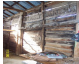
23434 Glendinning Homestead Balmoral woolshed slabs 2139