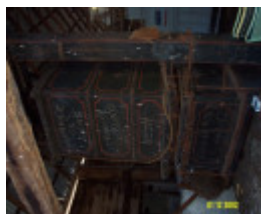
23434 Glendinning Homestead Balmoral woolpress 2136