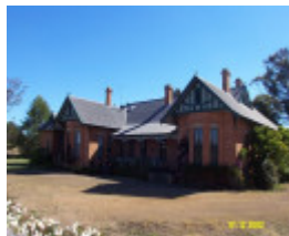
23434 Glendinning Homestead Balmoral facade 2133