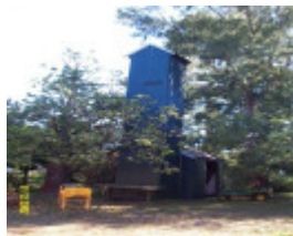
23434 Glendinning Homestead Balmoral carbide tower 2135