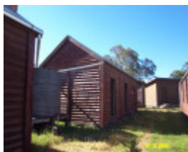
23434 Glendinning Homestead Balmoral men s quarters 2152