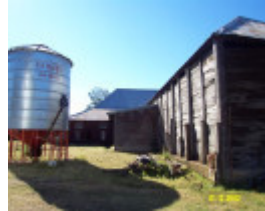
23434 Glendinning Homestead Balmoral woolshed 2147