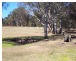
23434 Glendinning Homestead Balmoral sheep dip 2144