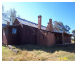
23434 Glendinning Homestead Balmoral men s quarters 2150