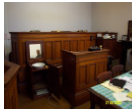
23437 Courthouse Former Martin St Penshurst interior 1032