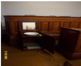
23437 Courthouse Former Martin St Penshurst interior 1031