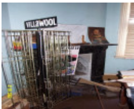
23437 Courthouse Former Martin St Penshurst interior 1033