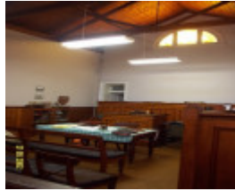
23437 Courthouse Former Martin St Penshurst interior 1027