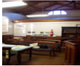
23437 Courthouse Former Martin St Penshurst interior 1028