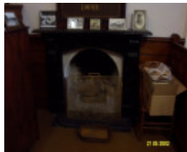
23437 Courthouse Former Martin St Penshurst interior 1030