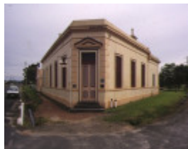
1 bank of victoria bay street port albert front view