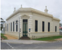
PORT ALBERT MARITIME MUSEUM SOHE 2008