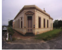
1 bank of victoria bay street port albert front view