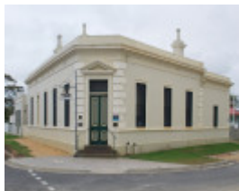
PORT ALBERT MARITIME MUSEUM SOHE 2008