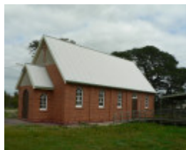
St Mary's Catholic Church, Midland Highway, Lethbridge