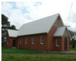
St Mary's Catholic Church, Midland Highway, Lethbridge