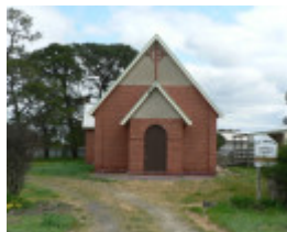
St Mary's Catholic Church, Midland Highway, Lethbridge