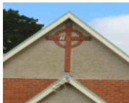
November 2003.