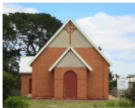
November 2003.