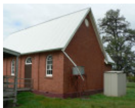
St Mary's Catholic Church, Midland Highway, Lethbridge