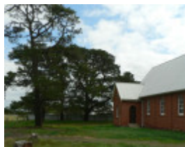
St Mary's Catholic Church, Midland Highway, Lethbridge