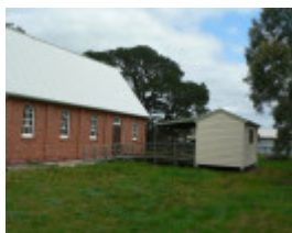
St Mary's Catholic Church, Midland Highway, Lethbridge