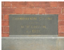
Former Presbyterian Church, Linton