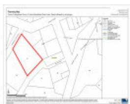
Extent of registration map