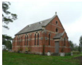
Former Presbyterian Church, Linton