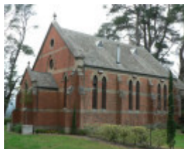
Former Presbyterian Church, Linton