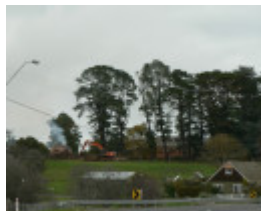
Former Presbyterian Church, Linton