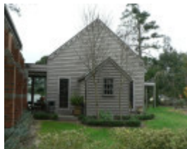
Former Presbyterian Church, Linton