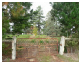
Former Presbyterian Church, Linton