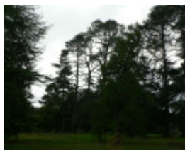
Former Presbyterian Church, Linton