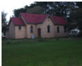
November 2003.