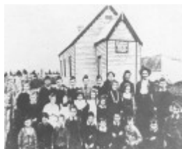
St Joseph's Catholic Church Complex, Meredith, outbuilding