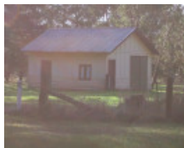
Meredith Catholic Church