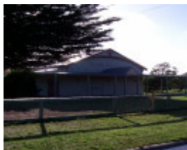
St Joseph's Catholic Church Complex, former School