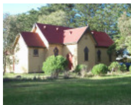
St Joseph's Catholic Complex, Meredith, Church from north-west