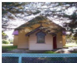
St Joseph's Catholic Church Complex, Meredith, church entrance