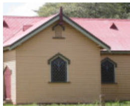
November 2003.