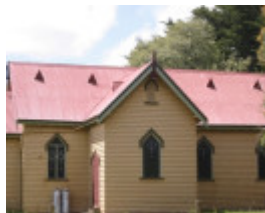
November 2003.