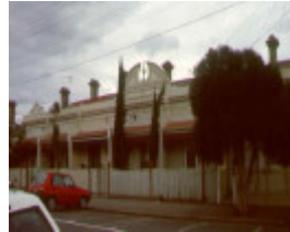
1 jubilee terrace nott st port melbourne