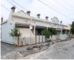
JUBILEE TERRACE SOHE 2008