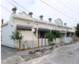
JUBILEE TERRACE SOHE 2008