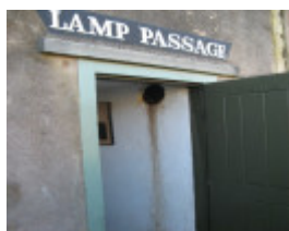
Portland Battery_28 Apr 2011_KJ (47).jpg