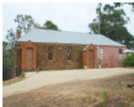
FORMER DENOMINATIONAL SCHOOL SOHE 2008