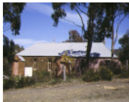
1 former denominational school number 413 church street maldon front view oct1997