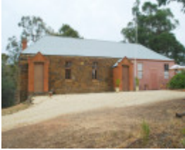
FORMER DENOMINATIONAL SCHOOL SOHE 2008