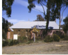
1 former denominational school number 413 church street maldon front view oct1997