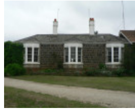
Woolbrook Homestead south elevation