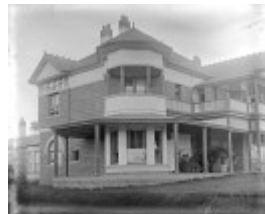
Original Woolbrook Homestead