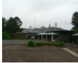
Woolbrook homestead from the north west