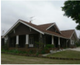
Original Woolbrook Homestead