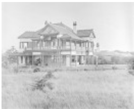
Original Woolbrook Homestead