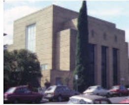
1 second church of christ scientist camberwell front view