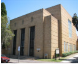
SECOND CHURCH OF CHRIST SCIENTIST SOHE 2008