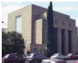
1 second church of christ scientist camberwell front view