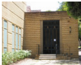
SECOND CHURCH OF CHRIST SCIENTIST SOHE 2008