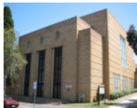
SECOND CHURCH OF CHRIST SCIENTIST SOHE 2008