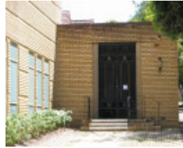
SECOND CHURCH OF CHRIST SCIENTIST SOHE 2008