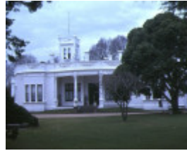
1 billilla brighton front view jun1982