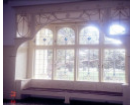
billilla halifax street brighton piano room window she project 2003