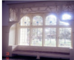
billilla halifax street brighton piano room window she project 2003