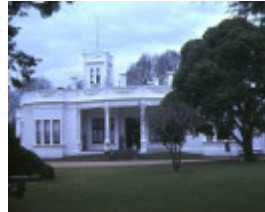
1 billilla brighton front view jun1982