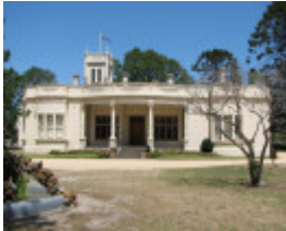
BILLILLA SOHE 2008