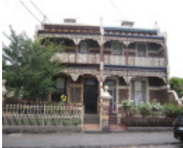
18-20 Davies Street.JPG