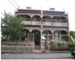
18-20 Davies Street.JPG