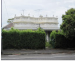
43 Kent Street.JPG